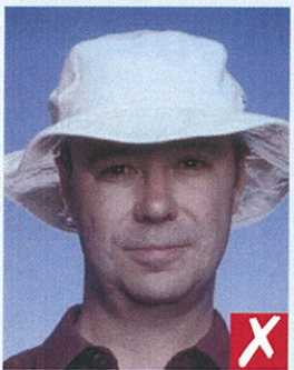
wearing a hat