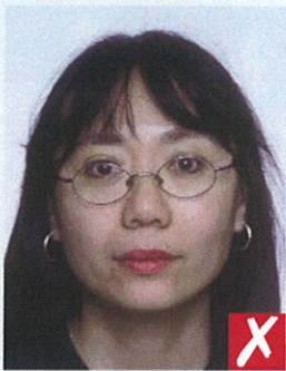
frames covering eyes