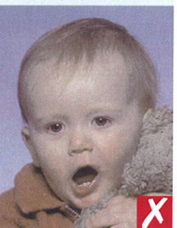
mouth open and toy too close to face