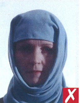
shadows across face