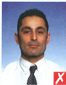
too far away