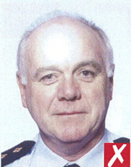
flash reflection on skin