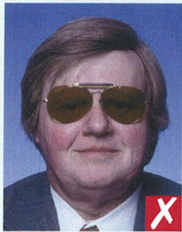
dark tinted lenses