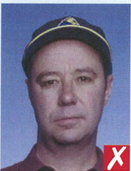
wearing a cap