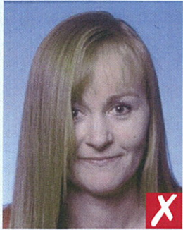
hair across eyes