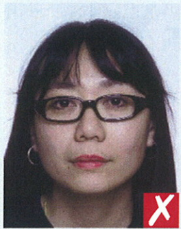
frames too heavy