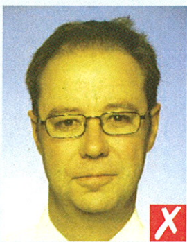
unnatural skin tones