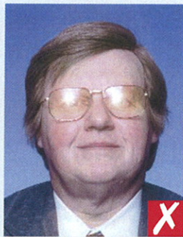
flash reflection on lenses