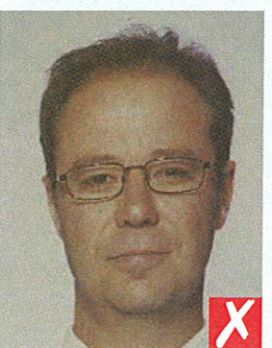
washed out colour