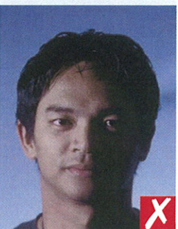
shadows across face